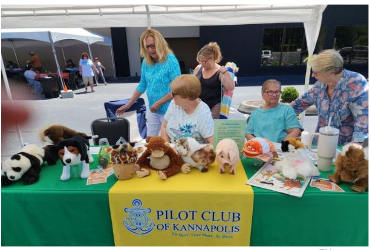
Pilot members of Kannapolis share BrainMinders<sup>TM</sup> with visitors to the He's Alive Church gathering.