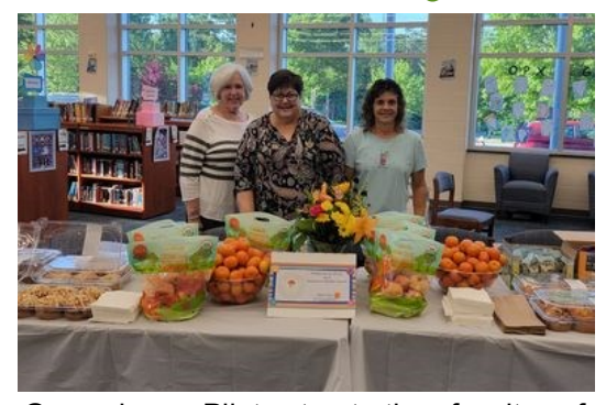
Greensboro Pilots treat the faculty of Jamestown Middle School with delicious snacks during testing week.