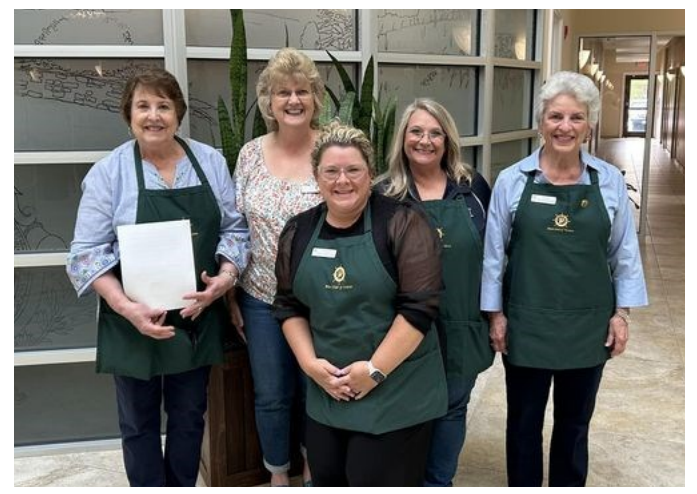
Valdese Pilots presented the AED to the town of Valdese.