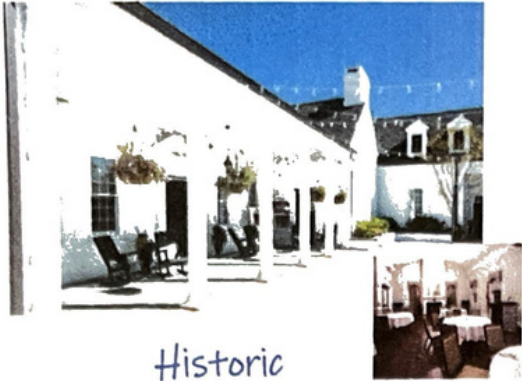
Historic Morganton Community House 120 N King Street Morganton, NC 28655