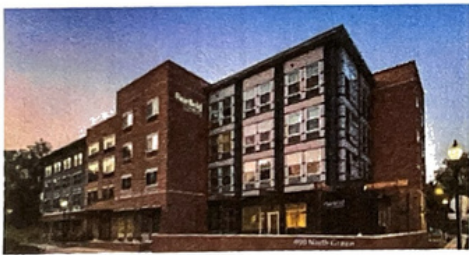
Accommodations Fairfield Inn & Suites 400 North Green St Morganton, NC 28655 844-200-8708