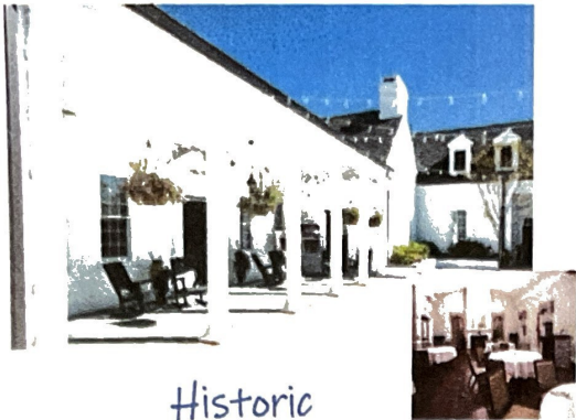
Historic Morganton Community House 120 N King Street Morganton, NC 28655