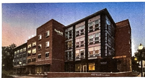
Accommodations Fairfield Inn & Suites 400 North Green St Morganton, NC 28655 844-200-8708